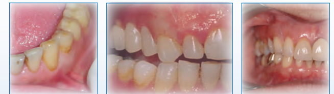
Valplast® is made from a translucent nylon material that blends in with your natural gum tissues to become virtually invisible when placed in the mouth.

Millions of patients have already discovered the benefits of wearing a Valplast Flexible Partial. Ask your dentist about Valplast today!