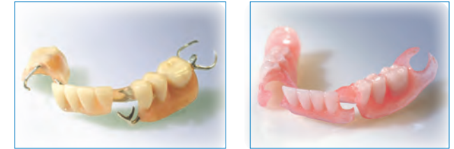
The Valplast® partial is more comfortable and light-weight than conventional metal partials.

More patients fall into the Valplast® price range than that of any other restorative option. Whether you are looking to replace your missing teeth for the first time, upgrade from a restoration of lesser value or save on the cost of fixed restorations, Valplast® provides an affordable, cosmetic solution.